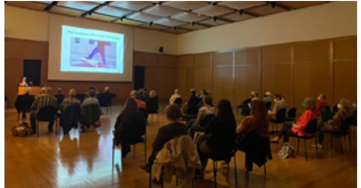
Kelly Church Lecture: Black Ash Basketry, April 13, 2022